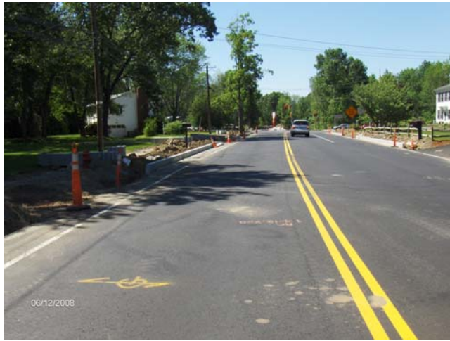
Middlesex Turnpike- curb installation