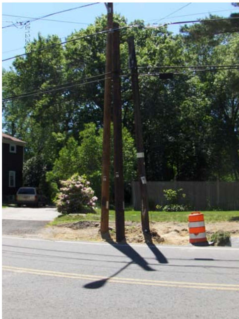
Concord Rd – utility pole issues