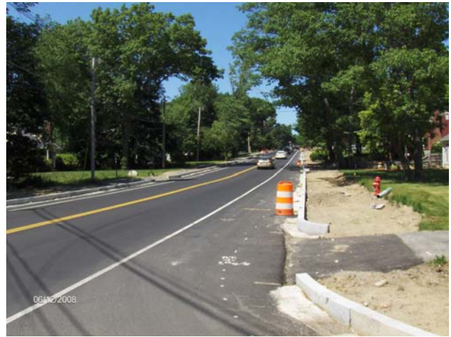
Concord Road – sidewalk preparation

Binder course paving was installed in May 2008. Sidewalk and curb installation was waiting on the utility pole relocations. By the end of the fall, most of the curb installation and placement of concrete sidewalk was completed. Cabot Corporation, as part of their expansion project, worked concurrently with MassHighway and the contractor to modify the Concord Road intersection with Middlesex Turnpike.