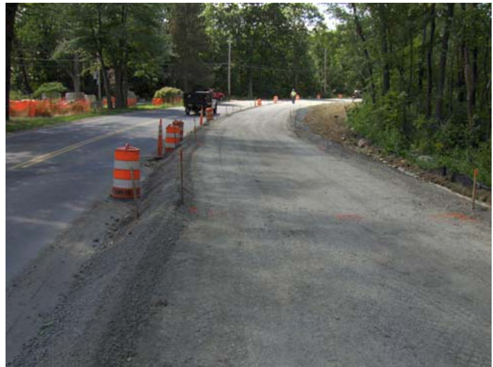
Concord Road Reconstruction