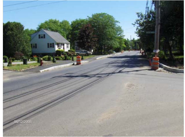
New curb/sidewalks/pavement - Cook St