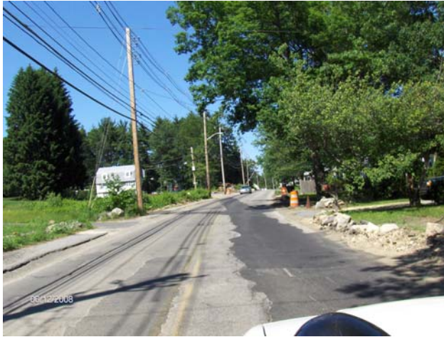
Drainage installation - Cook St

In the spring of 2008, drainage was installed on portions of Cook Street. In the summer of 2008, these areas were reclaimed and paved with base course. Granite curbing and sidewalks have been installed on a large portion of Cook Street. Work was done at the intersection of Cook Street and Boston Road, with new curbing, sidewalks and wheelchair ramps installed.