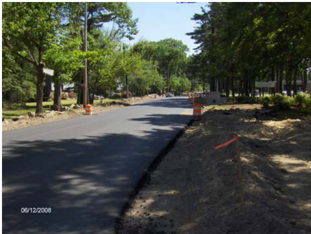
Base course pavement - Cook St