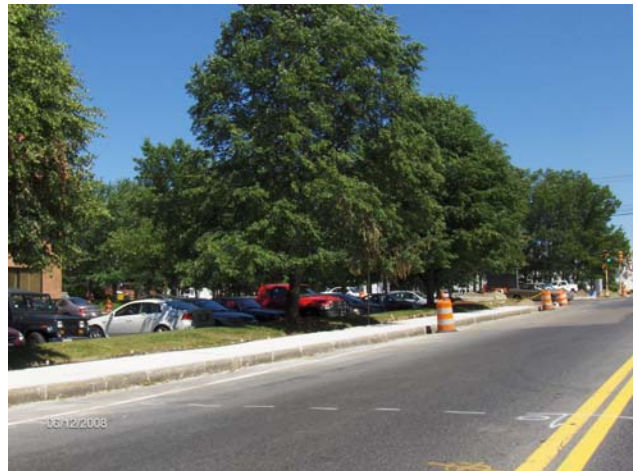
New sidewalk - Boston Rd at Cook St