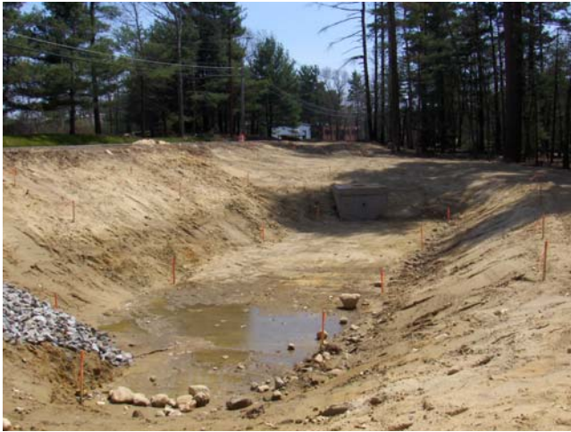
Detention Pond on Alexander Rd

In Spring 2009 detention ponds were installed on Alexander Road in two locations. The compensatory flood storage area (CFSA) on Cook Street was also constructed.