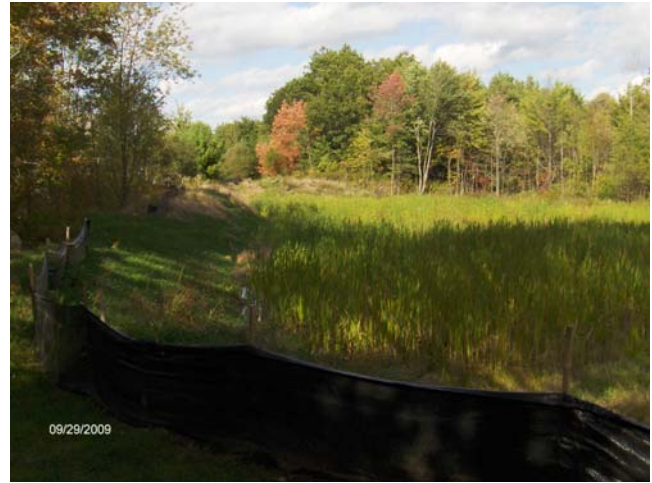
Compensatory Flood Storage Area

In the Spring 2009, further road widening and drainage installation began on Alexander Road. Beginning in May, portions of the roadway were reclaimed, regraded and binder course installed. This was done one section at a time throughout the summer.