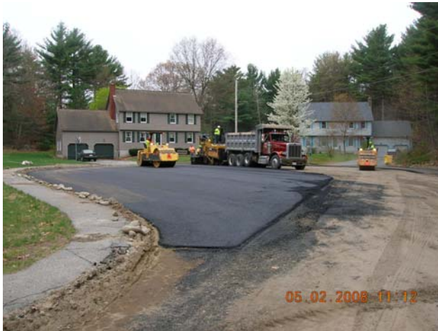
Paving binder course on Jared Circle