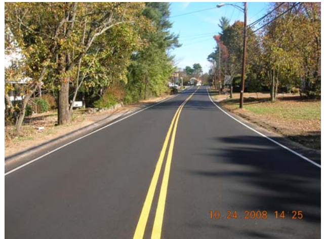
Salem Road Final Paving – October 2008