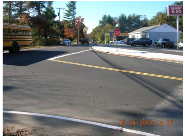
George Brown Street at Salem Road – Intersection Redesign – October 2008