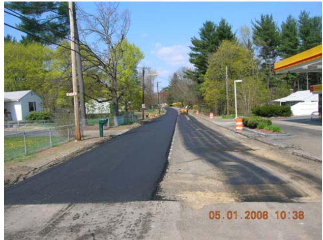
Preparing to pave Salem Road

Sewer installation on Harrington Road, Silverbirch Road and Prospector Road was completed in June 2008.