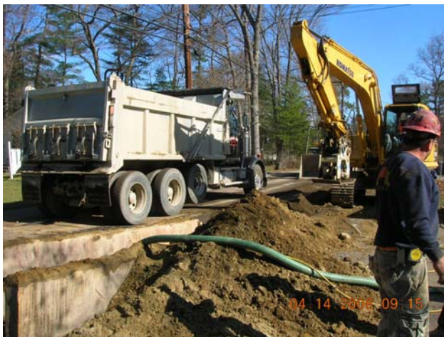
Baldwin Road Sewer Main installation – April 2008

The first area of new sewer installed on Salem Road runs from the Wilmington Town Line at the Aqueduct to #292 Salem Road near the Fire Station at Baldwin Road, approximately 3,145 feet. The sewer trench was paved with a temporary patch for the winter months before milling and paving of the binder course was completed in August 2008. Sewer installation on Eastgate Road, Jared Circle, GreenAcre Drive, Lantern Lane and most of Carline Drive was completed over the winter months. Sewer main on Baldwin Road was completed in April 2008 and services were installed shortly thereafter.