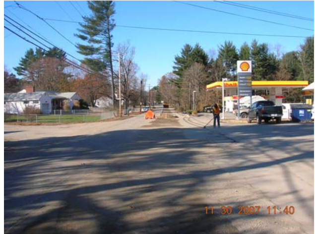
Temp trench Salem Rd – Nov 07

The first area of new sewer installed on Salem Road runs from the Wilmington Town Line at the Aqueduct to #292 Salem Road near the Fire Station at Baldwin Road, approximately 3,145 feet. The sewer trench was paved with a temporary patch for the winter months before milling and paving of the binder course was completed in August 2008. Sewer installation on Eastgate Road, Jared Circle, GreenAcre Drive, Lantern Lane and most of Carline Drive was completed over the winter months. Sewer main on Baldwin Road was completed in April 2008 and services were installed shortly thereafter.