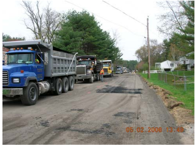
Paving binder course on Greenacre Drive