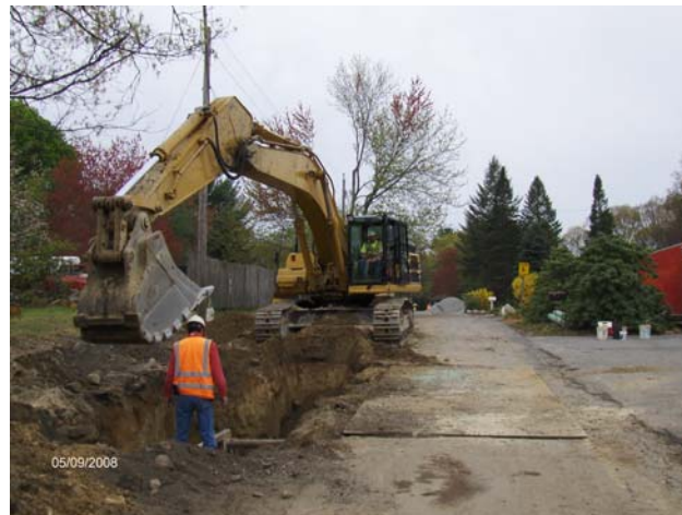
Silverbirch Rd Sewer installation – May 2008

Sewer installation on Harrington Road, Silverbirch Road and Prospector Road was completed in June 2008.