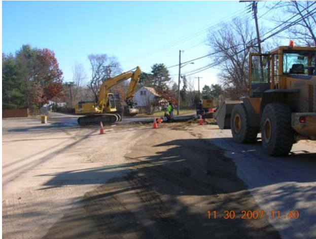
Salem Rd at George Brown St – Nov 07

DeFelice Corporation of Dracut was the contractor for the project. Construction started in October 2007 beginning on Salem Road (Route 129) at the Billerica/Wilmington Town Line. A significant traffic detour was in place during the construction on Salem Road. The detour was coordinated with the Billerica Traffic Safety Officer and the Towns of Wilmington and Tewksbury Police Departments.