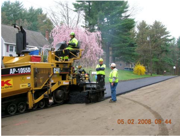
Paving binder course on Eastgate Road