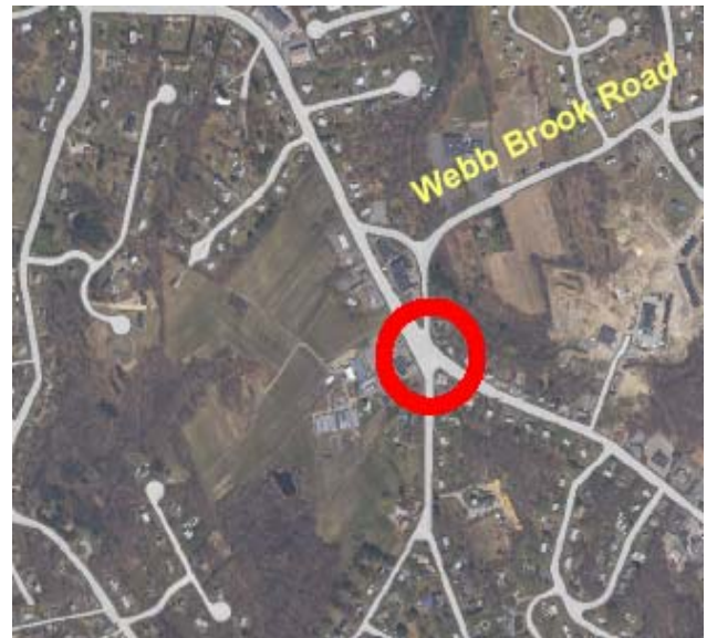
Boston Road (3A) / Treble Cove Road, Bridge Street, Wyman/Webb Brook Road