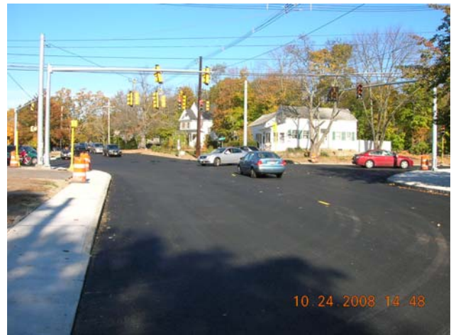
Treble Cove Rd/Boston Rd – October 24, 2008