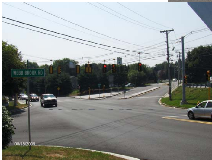
Boston Rd @ Wyman/Webb Brook Rd