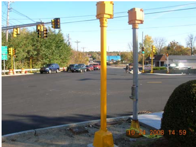
Bridge St/Boston Rd – October 24, 2008

A majority of the road work was completed at the Treble Cove Road and Bridge Street intersections in 2008. Final paving at these two intersections was installed in October 2008. Electrical work to install the new traffic signals was completed by spring 2009. Once the electrical work was complete, the old system was removed and the sidewalks and landscaping were completed.