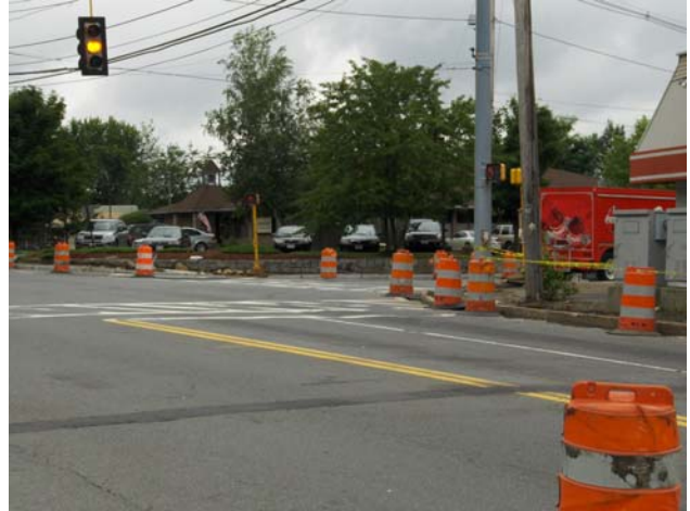
Treble Cove Road at Boston Road – August 2008

A majority of the road work was completed at the Treble Cove Road and Bridge Street intersections in 2008. Final paving at these two intersections was installed in October 2008. Electrical work to install the new traffic signals was completed by spring 2009. Once the electrical work was complete, the old system was removed and the sidewalks and landscaping were completed.