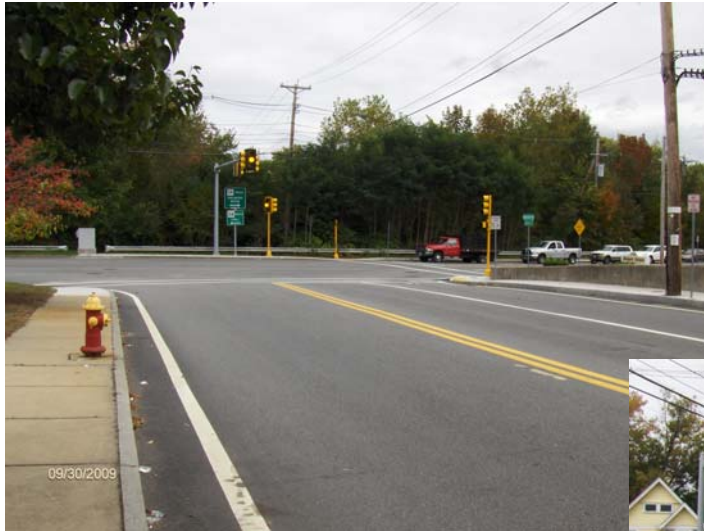
Boston Rd @ Bridge St

A final walkthrough of this project was completed on August 5, 2009.