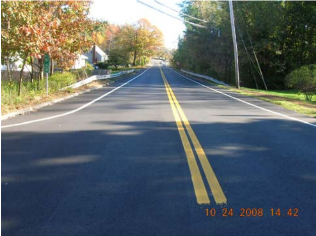
Boston Road between Chelmsford Rd and Rangeway Rd

A new 12” water main was installed in Boston Road from Chelmsford Street to Rangeway Road. The final milling and paving for this section of road was performed in August 2008.