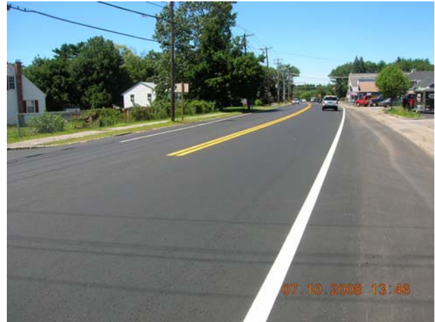
July 2008 – Final paving on Boston Rd

A full width overlay of all areas disturbed in Boston Road, from the Shawsheen River to Burlington has been completed.