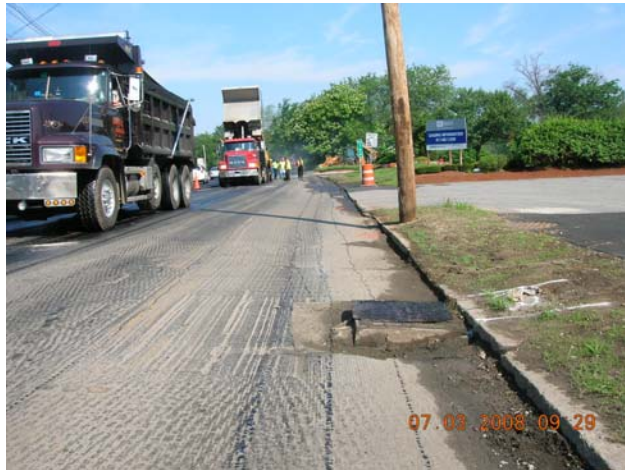
July 2008 - Milling/Paving of Boston Rd