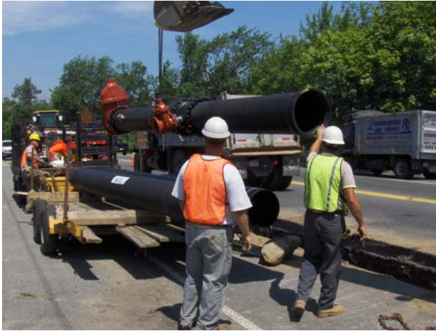
16" Water Main Installation on Boston Road July 2007

A new 12" water main has been installed in Boston Road from Adelman Road to Francis Wyman Road in Burlington.