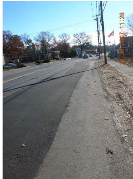
Nov 2007 – Final trench patches on Boston Road